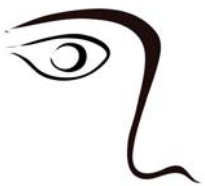
South Australian Institute of Ophthalmology

Alcon ® The Specialist Eye Care Company ® platinum sponsor